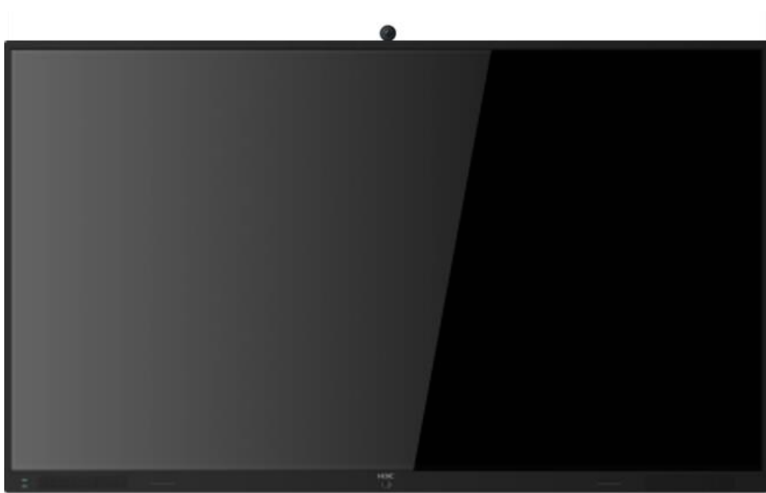
H3C 4K Interactive Screen H3C MG65A2

The 65-inch 4K cloud screen is an all-in-one intelligent terminal device with ultra-high-definition display, remote video, smooth writing, and device management, helping the digital transformation and upgrading of conference office, education, medical and other scenarios, and the simplified deployment of video terminals. H3C Magichub is equipped with Win11 and Android11 dual system, its integrated architecture greatly improves the performance of the whole machine, combined with the ultimate audio and audio, showing a new experience of digital office.